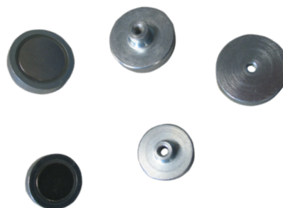
Distance including magnet