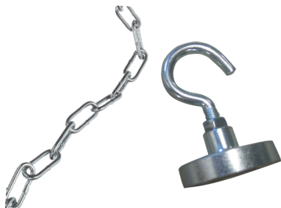
Chains and magnet with screw hook